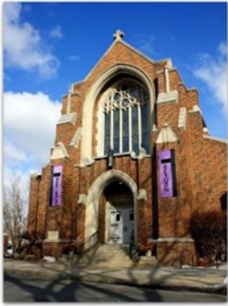
Pilgrim Lutheran Church 1935 St. Clair Avenue St. Paul, MN 55105 651-699-6886 PilgrimStPaul.org