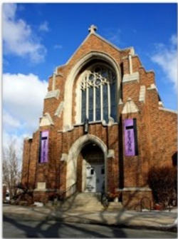
Pilgrim Lutheran Church 1935 St. Clair Avenue St. Paul, MN 55105 651-699-6886 PilgrimStPaul.org

According to the multitude of your tender mercies, remove my offenses.